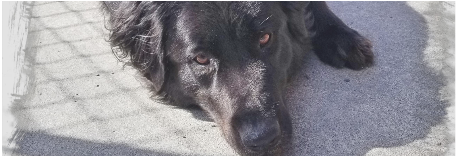
Pictured above: Brody, male dog aged 4 years 11 months. Come meet him today!